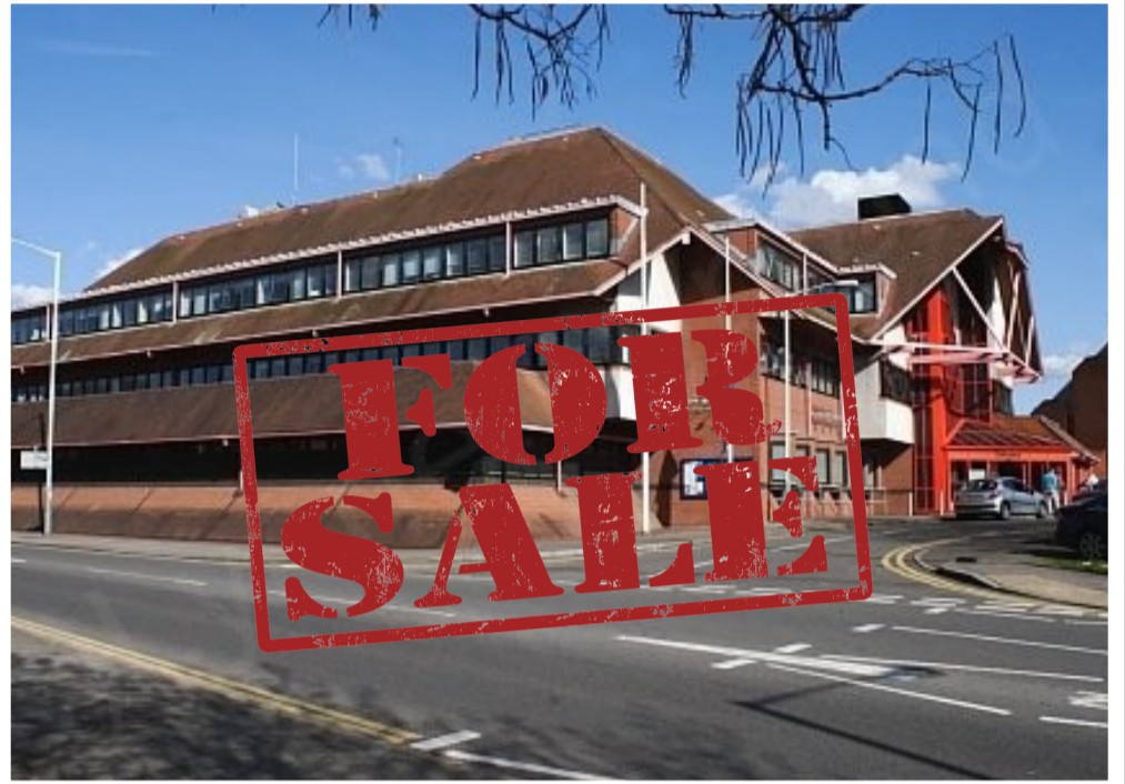
Above: Uxbridge Police Station on Harefield Road is currently under threat from the Mayor of London's changes to Policing in Hillingdon

Your local Conservative team oppose Labour’s proposal to close Uxbridge Police station and believe it is vital for this resource to continue in our main town centre.